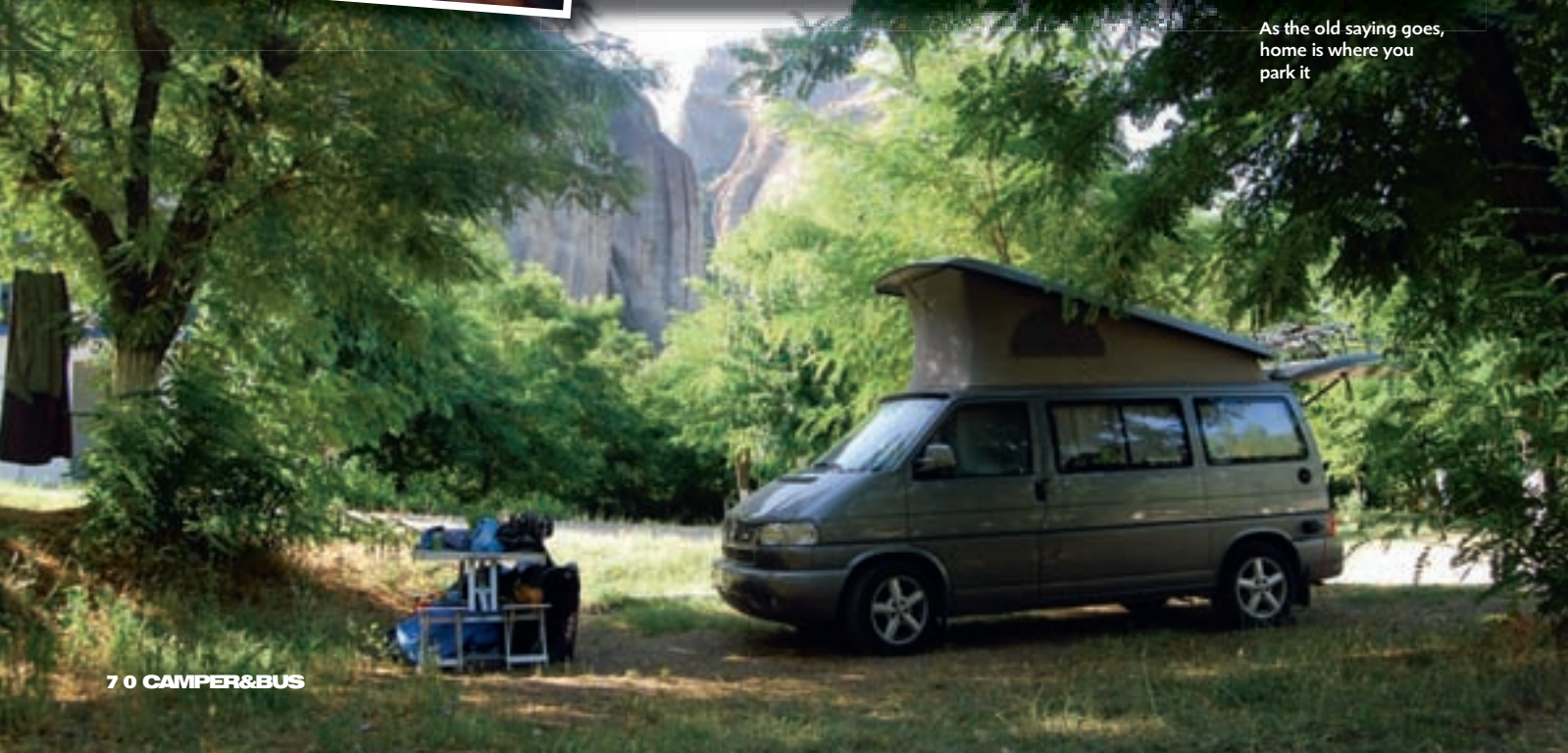
As the old saying goes, home is where you park it

infamous leaning tower. From there we continued down the coast, passing field after field of blazing red poppies and arrived at lake Bracciano just outside Rome. We camped on the lake's edge with the swans and a bed of pollen that had covered the campsite like a cotton-wool cloud.