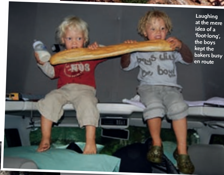
Laughing at the mere idea of a 'foot-long', the boys kept the bakers busy en route

We decided to go in search of a more remote pitch, so drove to the tip of the peninsula where we found Kastris Camping. Signs along the way directed us to 'Kastris Camping opposite Skiathos'. The location was so idyllic, Skiathos did indeed face us in the distance and the beach was great for swimming. We pumped up the kayaks once more and explored the neighbouring bays. We even blagged a boat trip for the whole family from a very friendly German whose motorboat we'd helped to launch. It was lovely to see the coastline and check out some incredible villas hidden