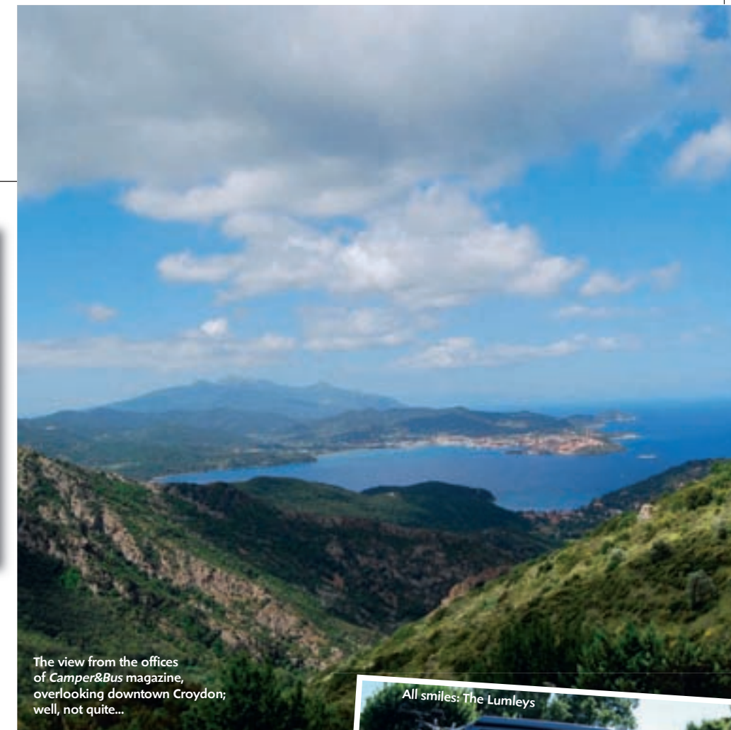
The view from the offices of Camper&Bus magazine, overlooking downtown Croydon; well, not quite...