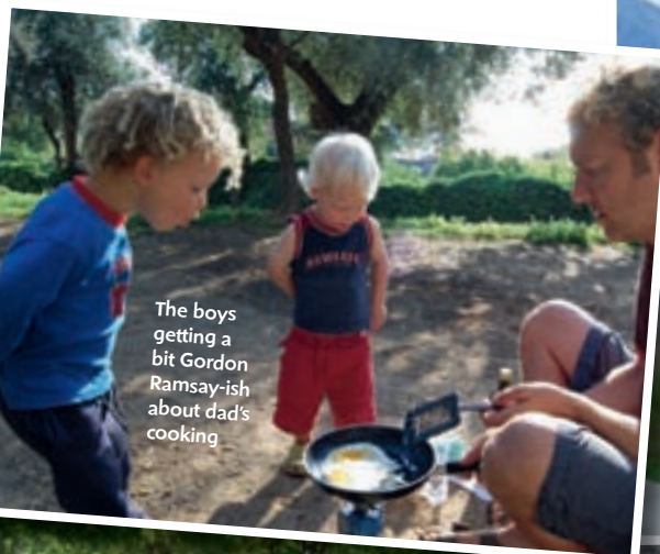
The boys getting a bit Gordon Ramsay-ish about dad's cooking