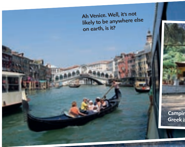
Ah Venice. Well, it's not likely to be anywhere else on earth, is it?