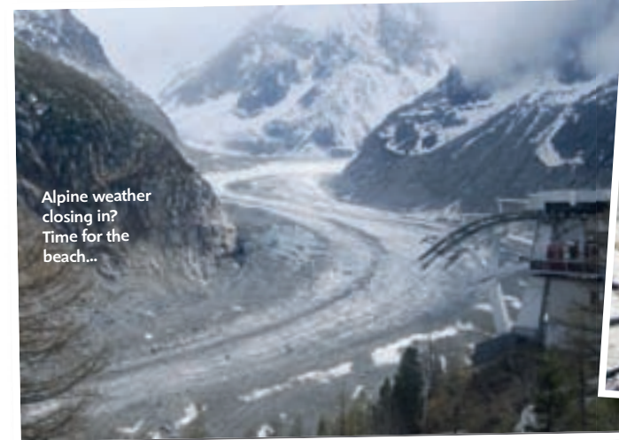
Alpine weather closing in? Time for the beach...

in Laigueglia, a beautiful seaside village between San Remo and Savona. We had a sea view from our Camper and saw some great sunrises. Although set back a bit from the beach, we could still hear the waves and the fisherman in their boats at dawn gathering the morning catch. The town was typically Italian, with cobbled streets, little alleyways, piazzas, geraniums – it was lovely just to stroll about. The beach was immaculate, with sun loungers meticulously lined up to within the nearest centimetre (we actually saw a lady with a tape measure) and the beach was regularly attended to and swept clean. From Laigueglia we made our way down the west coast of Italy. We decided to check out the Island of Elba on our way south, which was a real jewel. We had our first taste of camping right at the edge of a beach and were quite tempted to go no further! The sun shone and we had a fabulous week. The campsite catered for all our needs – a playground for the children and a great internet café/restaurant with everything from ice-creams to three-course dinners. We discovered some amazing hilltop towns and castles with spectacular panoramic views of the coastline and mainland Italy, hazy in the distance. On our return to the mainland we dropped in on Pisa, which was a bit of a shock to the system after the peace and tranquillity of Elba. But it was fantastic to see the