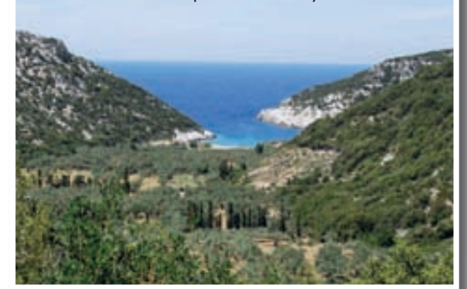
On Skopelos: our view to Glisteri Beach

We got to see the incredible inland scenery, which was mountainous with pretty little villages scattered throughout. On our first day out the temperature hit 45°C while we were touring Mount Pelion. Over the next two days we eventually hit 53.5° with a sultry 35° at night. We continued exploring and dipping in and out of the sea, which was on our doorstep, and at times became rough enough for boogie boarding. Both Zach and Louis stunned onlookers, and us, with their boogie boarding antics – totally no fear! Finally the weather broke and we managed