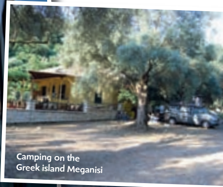
Camping on the Greek island Meganisi