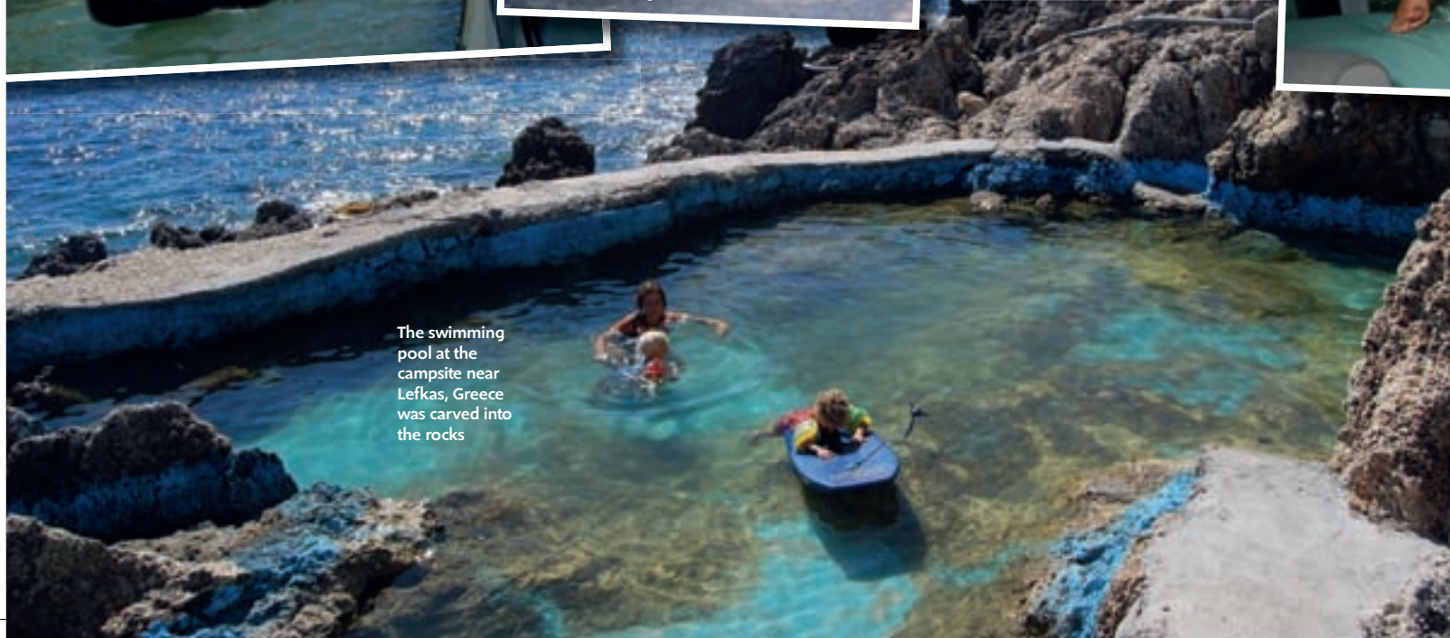
The swimming pool at the campsite near Lefkas, Greece was carved into the rocks